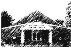
Pleasant View Missionary Baptist Church

Articles for the July issue are due Sunday, June 10, 2007.